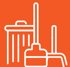
RECYCLING & WASTE SOLUTIONS