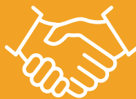
INDIGENOUS BUSINESS & SUPPLIERS