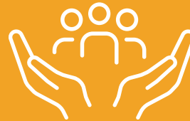
INDIGENOUS COMMUNITY ENGAGEMENT