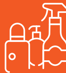
PRODUCTS AND CONSUMABLES

Within the PSG Holdings Cleaning Division over 20% of employees are Indigenous, making PSG Holdings well placed to work with Government Departments and commercial companies to achieve Indigenous policy objectives through the provision of quality and reliable services.